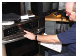
Safety testing due to RoHS changes